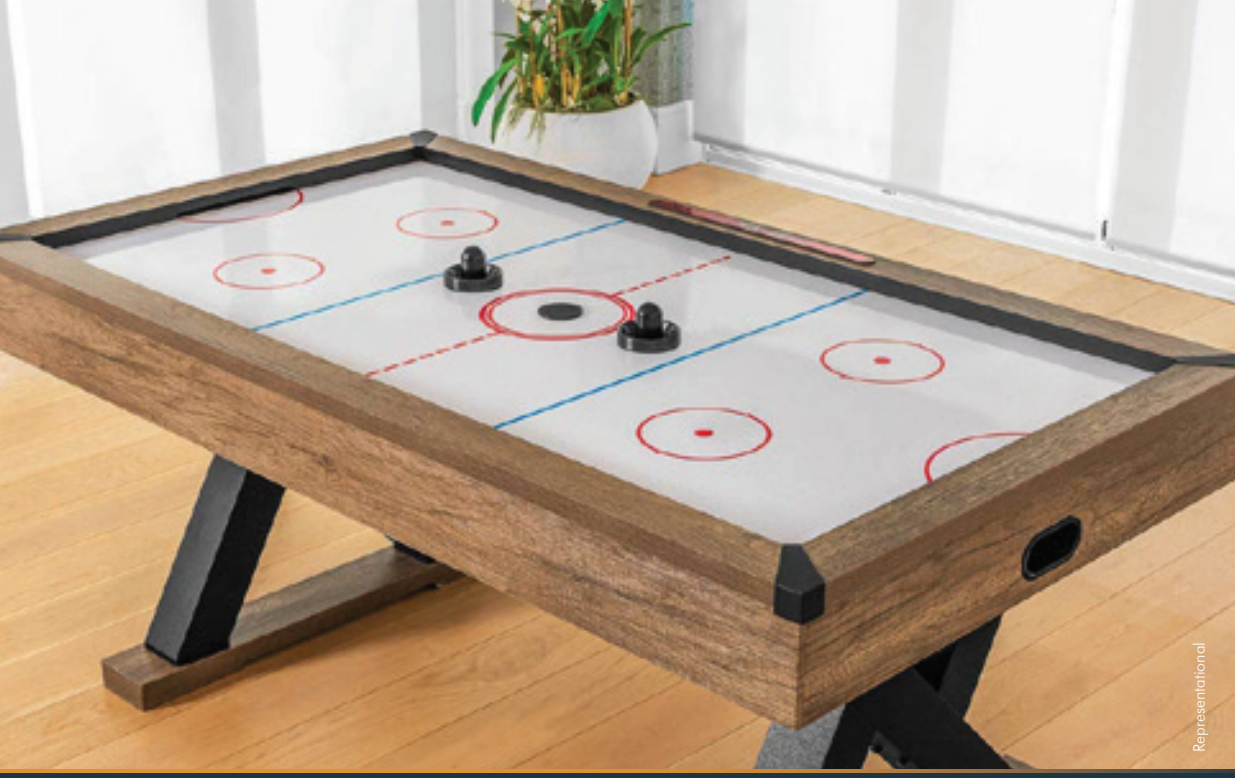
A SOULFUL AMBIANCE FOR THE SELECT HOMEOWNERS